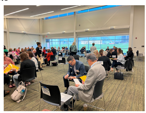
Board members participate in the Poverty

• Poverty is complex, with many contributing factors. When you are living with limited financial resources, something as simple as filling your gas tank is a milestone. It is essential that board